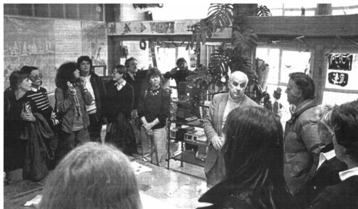
A foreign delegation visiting the Diana School